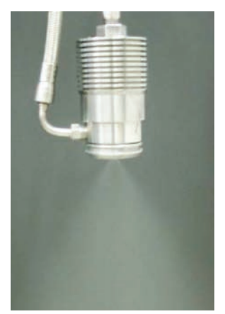
Non air-assisted urea injector (patents issued & pending)

The CCA SCR system has a unique and proprietary injection system, with a low cost, single fluid atomizer designed for optimum distribution of urea. The standardized injector is self cooling and is capable of operating with high turndown. One of the unique advantages of CCA's injector design is that it is capable of providing an optimum 60-65 micron droplet size distribution required, without an atomizing medium, such as steam or compressed air. The injector PLC is programmed to control the urea injection rate as a function of engine parameters related to NOx emissions, such as load and temperature. It can also be operated as a closed loop system based on a NOx output signal. Injector cycle frequency is factory set, and the period of time that the injector remains open is controlled by modulating the signal to a solenoid actuated injector valve. These features significantly reduce the lifecy-cle cost of the system.